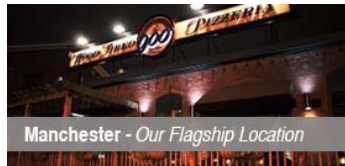
Manchester - Our Flagship Location

August 16th: Peak Organic Brewing Co. The Juice Pale Ale 5-7pm