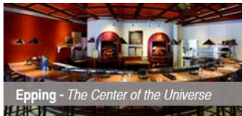
Epping - The Center of the Universe

Check out these awesome promotions for our Epping location: